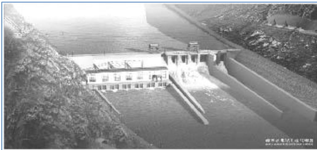
510 MW Zangmu Dam

The Chinese are completing the 510 MW Zangmu Dam over Brahmaputra 9 km northwest of Gyaca in Tibet. 2 more dams up stream of Zangmu Dam – 640 MW Dagu and 560 MW Jiexu are planned to be constructed within 18km of Zangmu. Another dam is planned downstream of Zangmu, - 320 MW Jiacha Dam. These 4 dams together will generate 2030 MW of electricity. These are true Run of the River dams with water flowing naturally over the dams generating sustainable power, unlike the 4 Hr Subansiri Lower Hydro Electric Project which will generate an arbitrary level of 2000MW at total destruction of the ecology and the livelihood of the riparian people. The same is the story of Siang, Dibang and Lohit Dams.